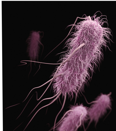
The systems and structures in the single cell bacterium E. coli are enormously complex

has proven accurate? First, what about the claim often made that simpler forms of life appear in the fossil record earlier than more advanced forms as though there were some kind of progression? Following is a statement from a college Biology text, "The Science of Biology," by Paul B. Weisz, "It is a very curious circumstance that rocks older than about 500 million years are so barren of fossils, whereas rocks younger than that not only are comparatively rich in them, but also include representatives of most major categories of organisms. Many hypotheses have been proposed to account for this sudden and