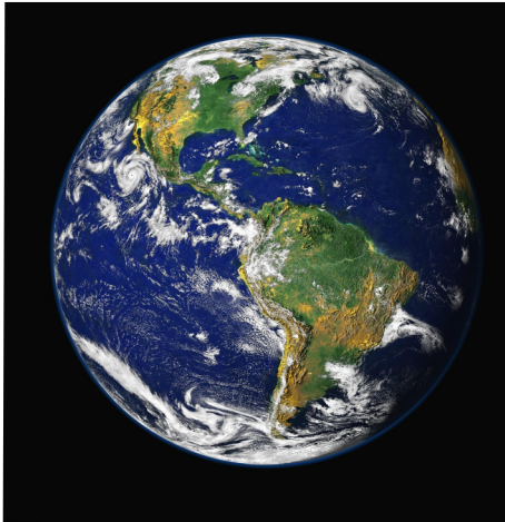
EARTH UNIQUELY SUITED FOR LIFE

horse from what began as a fish is entirely different. Such a theory flies in the face of considerable evidence. Many, including numerous reputable scientists, have concluded that those who believe in Darwinian evolution do